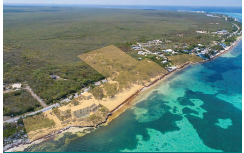
Artist's impression of the Sand Bluff Estate land holdings

The main residence is perched on an 18 foot height of cliff bluff enjoying 190 feet width of high elevation for the entire residence. Adjoining is an 880 feet of beautiful sugar quality reef protected beach enjoyed with high privacy wall from the road. An additional 117 feet of elevated land and beach for a total of 1,187 ft+/- of water frontage. Total size of the Sand Bluff Estate is 15.14 acres and 1,187 feet+/- of beach and water frontage and 212 feet of depth.