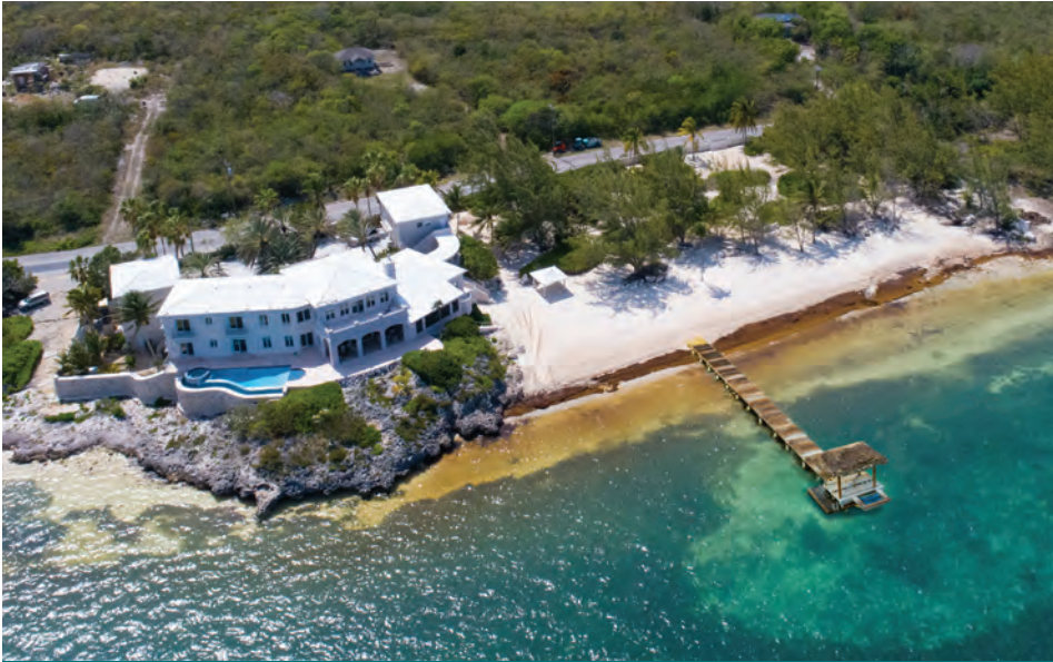
Artist's impression of potential dock installation